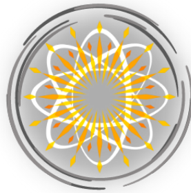
Fusion Sunday School

This year we will be talking about: Knowing Jesus Through the Old Testament.