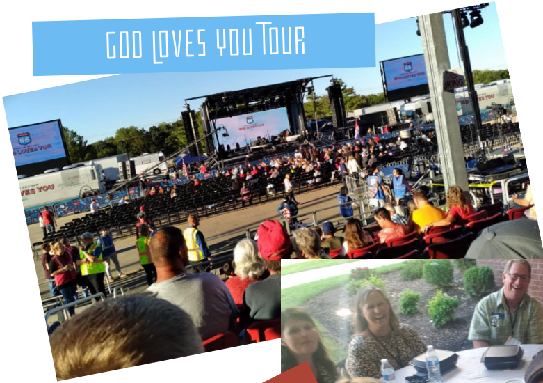
GOD LOVES YOU TOUR