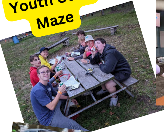
Youth Corn Maze