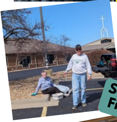
See A Need Fill a Need