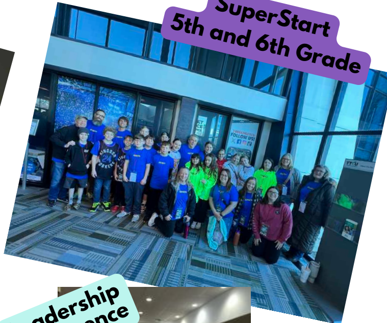
SuperStart 5th and 6th Grade