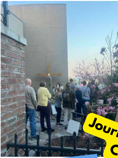
Journey to the Cross