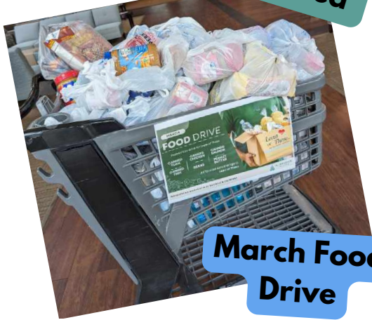
March Food Drive