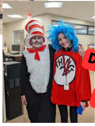
Dr. Seuss Week at ARK Preschool