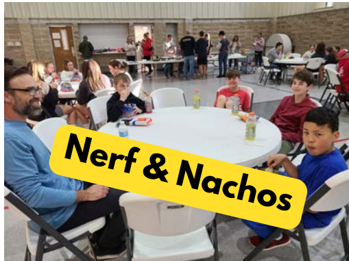
Nerf & Nachos