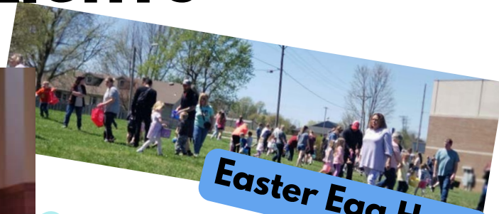
Easter Egg Hunt