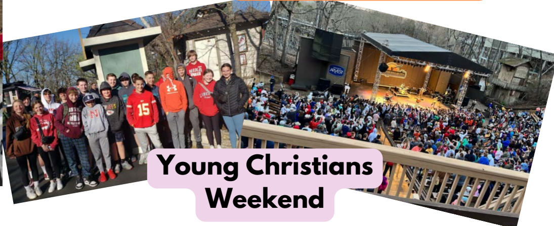
Young Christians Weekend