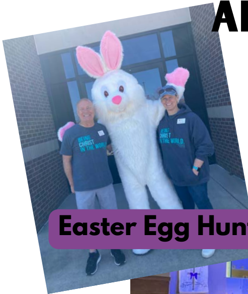
Easter Egg Hunt