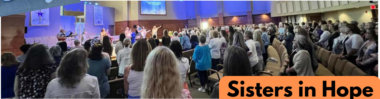
Sisters in Hope