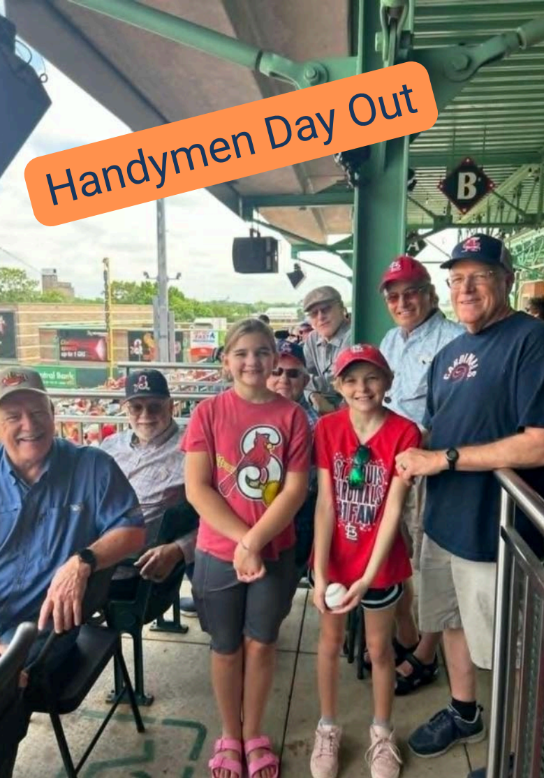
Handymen Day Out