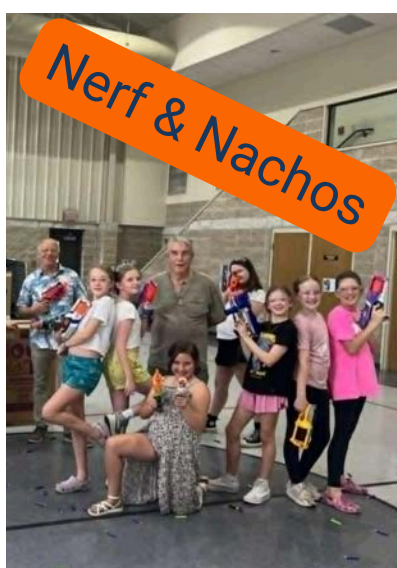
Nerf & Nachos