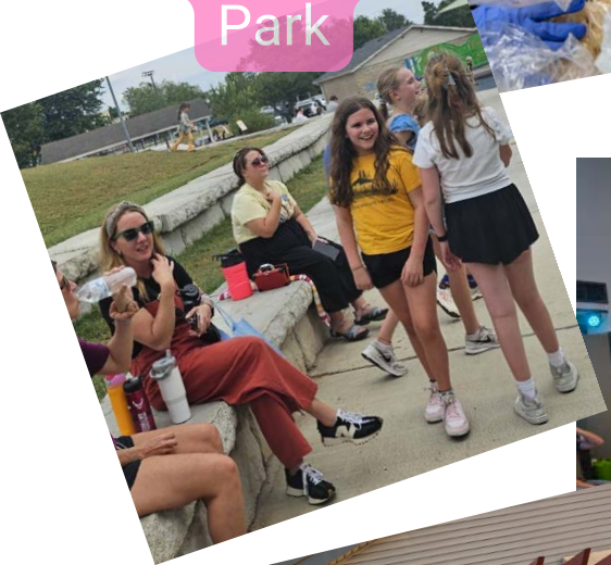
5th and 6 th Grade Park