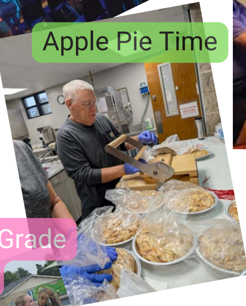
5th and 6 th Grade Park